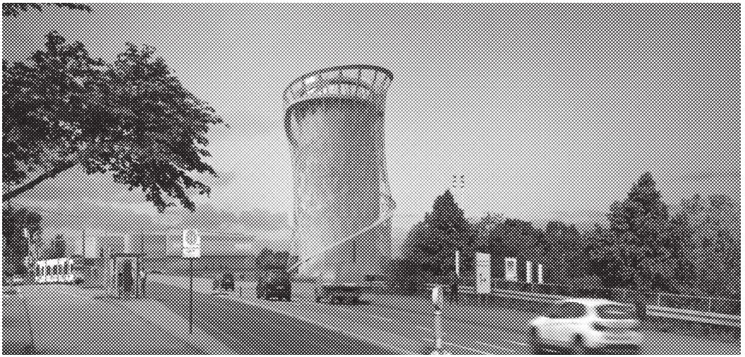
Energy storage observation tower Heidelberg , Germany