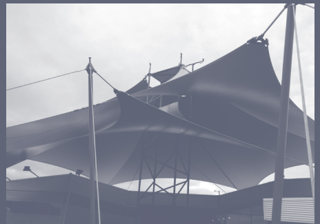
Penguin Parade Philip Island

Visit www.lsa.org for 2016 Design Award Registration & Entry Conditions