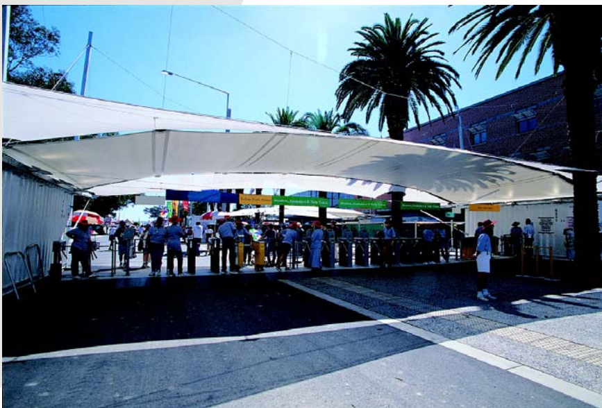
RAS Temporary Entry Structure, Sydney Showgrounds (Award of Excellence - Small Structures Category, LSAA Design Awards)

One of the major benefits to the Australian delegates was the opportunity to establish new contacts, get inspiration for future projects, and learn new techniques. The Congress also helped us recognise that the Australian industry is capable of producing world class lightweight structures.