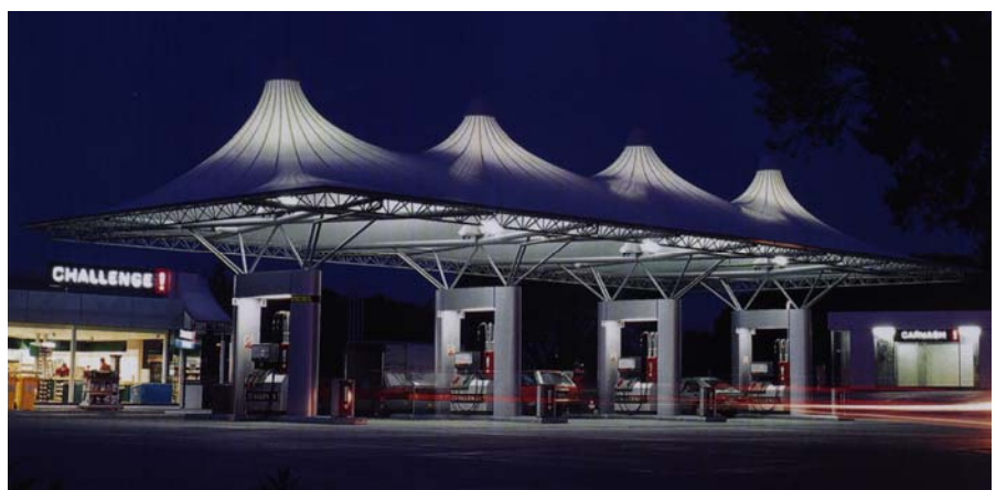
Night view of the Challenge Service Station canopy