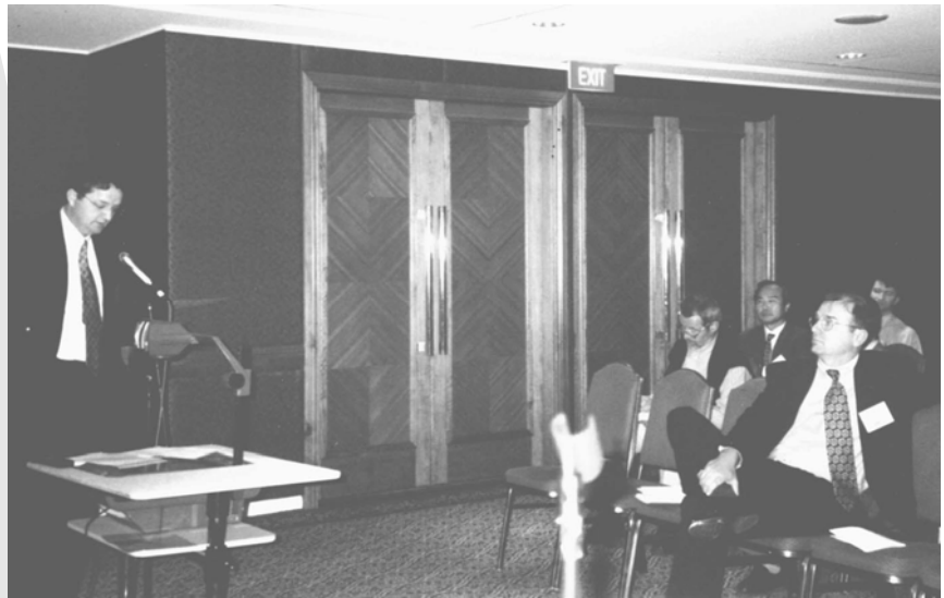
LSAA/IASS Workshop on Tension and Membrane Structures at LSA'98 Audience

The issue of Standards for Design and Execution vs Recommendations was extensively