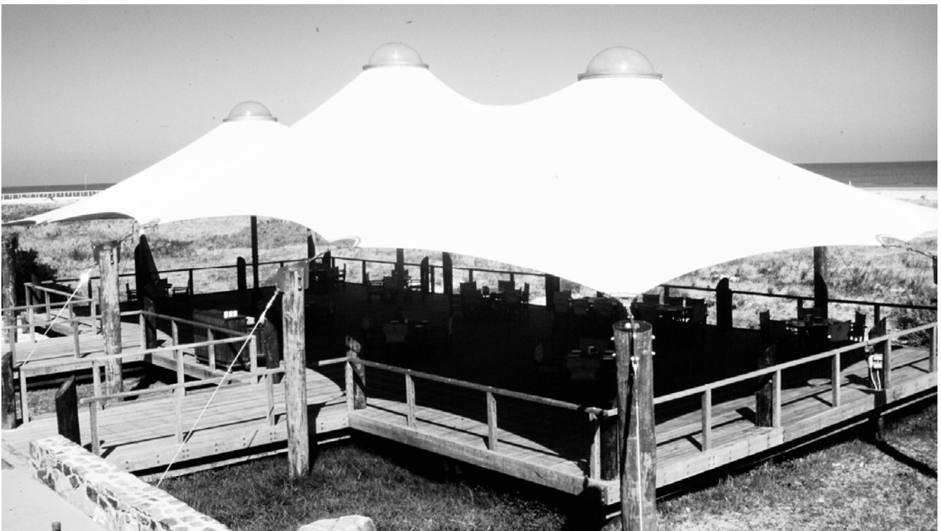
Across the gentle undulations of the new tent structure, the blue waters of St. Vincent's Gulf.

Architect: Matthews Architect Structure: Spacotech P/L Engineer: Connell Wagner P/L