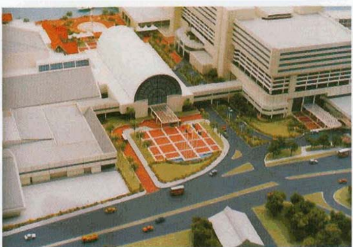
MODEL OF WORLD TRADE CENTRE, SINGAPORE. Courtesy SAA Architects.

CHEMFAB Pty Limited and their Singapore partners, I & M Prestressing Pte, have announced their success in obtaining notification of Award of Contract valued at $S6.7 million ($A4.2 million) for the design and construction of two SHEERFILL Teflon coated fibreglass atrium roofs in Singapore.